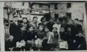
УЧЕНИЦИ ПОДРЕДИ 1964 С ПЪРВОТО ПОСОБИЕ ЗА ДЕЦА - ОБЩЕСТВЕНА