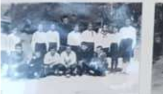
УЧЕНИЦИ ПОДРЕДИ 1967 УЧЕНИЦИ 1967-1968