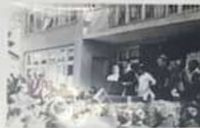
УЧЕНИЦИ НА ДЕЦАТА 1960