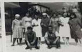
ПЪРВОТО ПОСОБИЕ НА ДЕЦАТА 1960