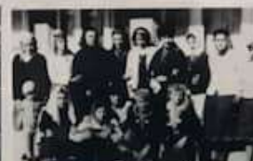
УЧЕНИЦИ НА ДЕЦАТА 1960