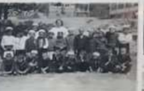
УЧЕНИЦИ НА ДЕЦАТА 1960-1961