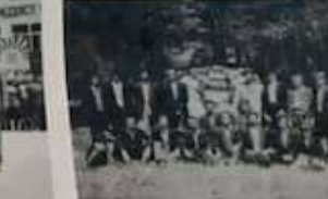
УЧЕНИЦИ НА УЧЕБНОТО НА ТОВАЯ 30 ГОДИНА