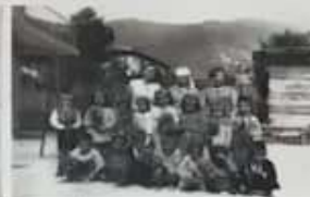
ГРУПА УЧЕНИЦИ С ДЕЦАТА 1960