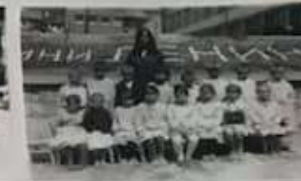
УЧЕНИЦИ НА ДЕЦАТА 1960