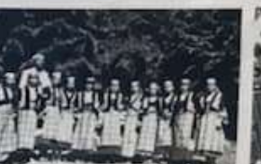
УЧЕНИЦИ НА ДЕЦАТА 1960-1961