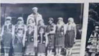
УЧЕНИЦИ НА ДЕЦАТА 1960