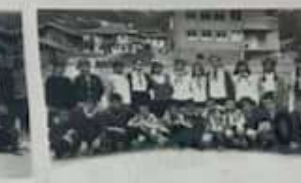
УЧЕНИЦИ ПОДРЕДИ 1968 УЧЕНИЦИ 1968-1969