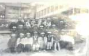
УЧЕНИЦИ ПОДРЕДИ 1967 УЧЕНИЦИ 1967-1968