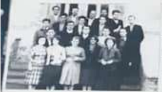
УЧЕНИЦИ И НАСТАВНИЦИ