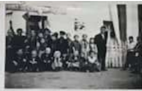
УЧЕНИЦИ С ПЪРВОТО ПОСОБИЕ ОТ ДЕЦА 1960