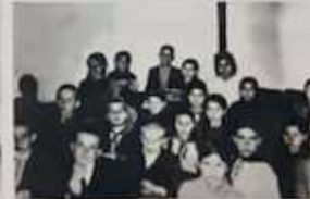
УЧЕНИЦИ НА ДЕЦАТА 1960