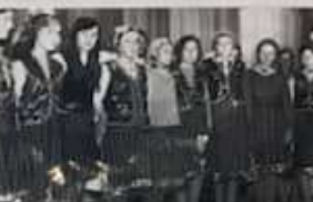
УЧЕНИЦИ НА ДЕЦАТА 1960