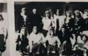
УЧЕНИЦИ НА ДЕЦАТА 1960