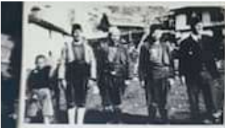
ГРУПА УЧЕНИЦИ И НАСТАВНИЦИ НА ПЪРВОТО УЧЕБНО ПОСОБИЕ ЗА ДЕЦА 1960-1961