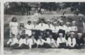
УЧЕНИЦИ ПОДРЕДИ 1968 УЧЕНИЦИ 1968-1969