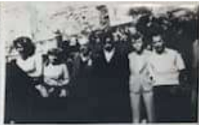
УЧЕНИЦИ И НАСТАВНИЦИ