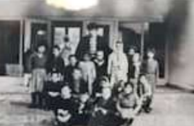
УЧЕНИЦИ С ПЪРВОТО ПОСОБИЕ ЗА ДЕЦА