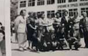
УЧЕНИЦИ ОТ 40 ГОДИНИ ПОСЛЕ НА УЧЕБНОТО 1964