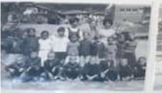
УЧЕНИЦИ ПОДРЕДИ 1967 УЧЕНИЦИ 1967-1968