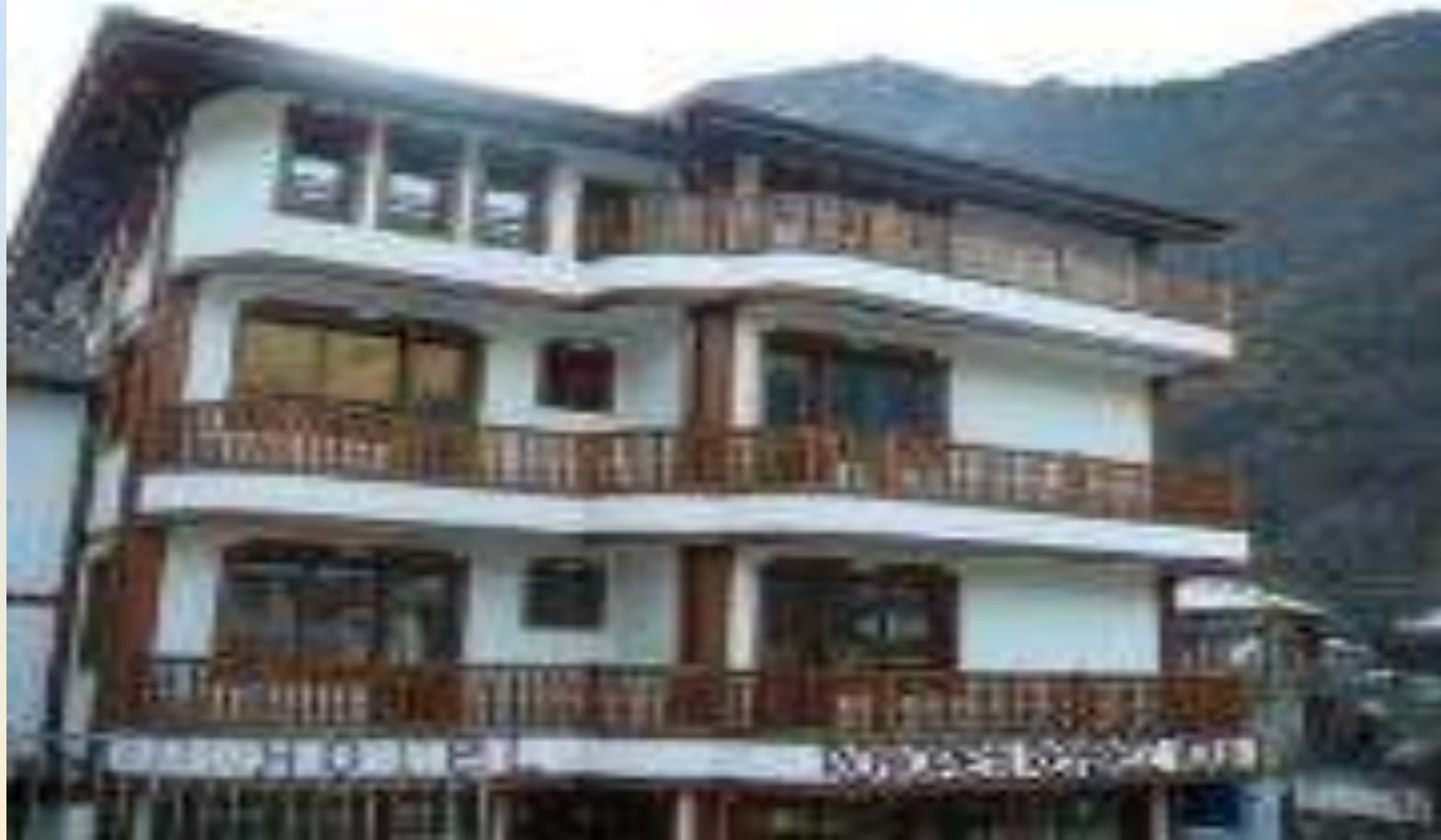
A hotel building in the village