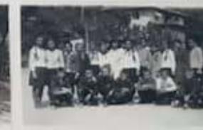
УЧЕНИЦИ ПОДРЕДИ 1967 УЧЕНИЦИ 1967-1968