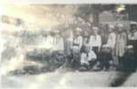
УЧЕНИЦИ ПОДРЕДИ 1967 УЧЕНИЦИ 1967-1968