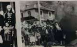
УЧЕНИЦИ НА ДЕЦАТА 1960