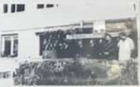
УЧЕНИЦИ НА УЧЕБНОТО